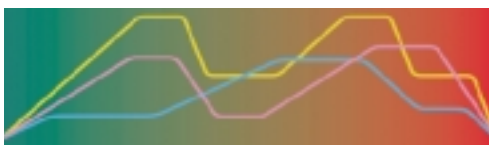
Diagram shows typical examples of