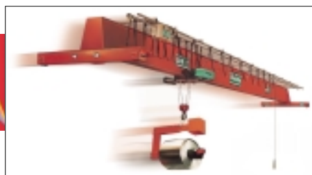
Kinematic – the science of pure motion!