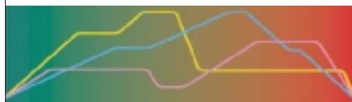
Pelloby Kinematic Drive crane control cycles